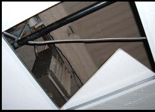
Unit Heater mounted in ceiling plenum as seen through removed ceiling tile